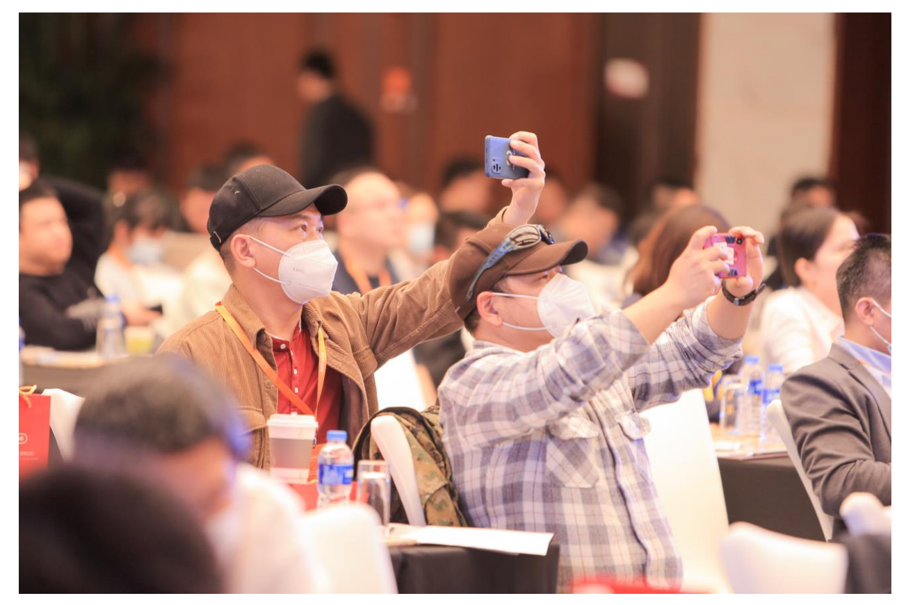
Photo: Bafang Electric's 6th Technical Exchange Conference event site

Bafang Electric (Suzhou) Co., Ltd. No. 6 Dongyanli Rd • Suzhou Industrial Park • 215125, Suzhou China