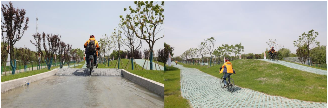
Photo: The riders from Bafang Cycling Testing Team